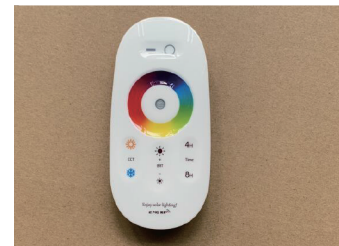
(With RGB model)