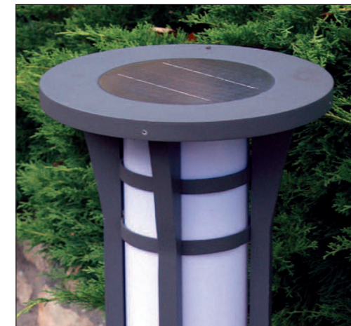
Detail of solar panel and opaque diffuser