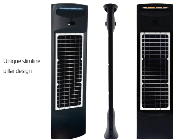
Unique slimline pillar design