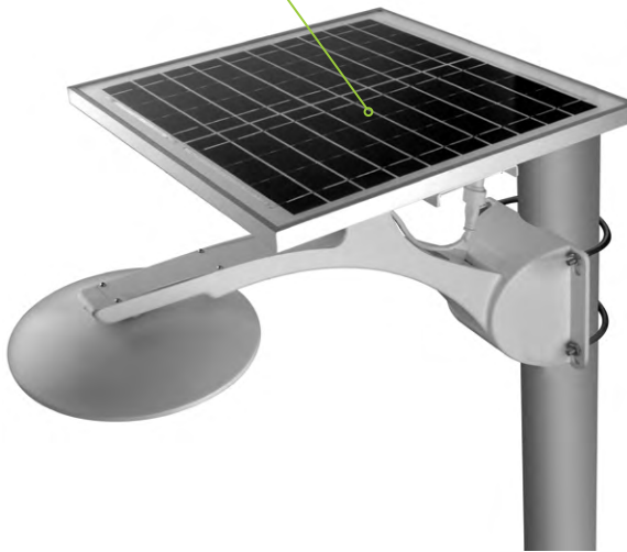
Orientate solar panel independently to the light head