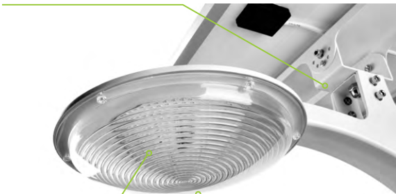
OSRAM 3030 LED